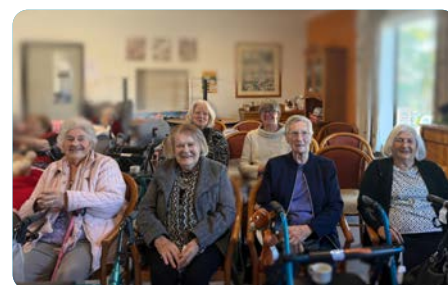
Gulf Views Residents visiting Howick Views