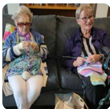
Weekly Knitting Club