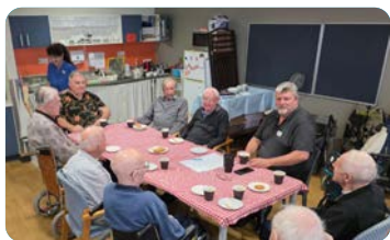
Men’s Health Club