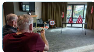
Target Shooting Activity