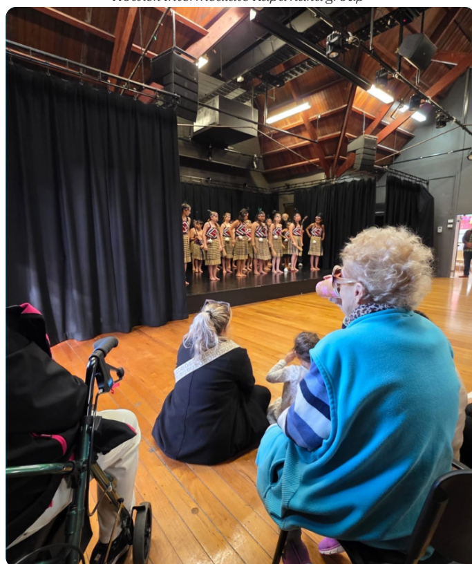
One of our residents watching a performance at Owairoa Marae