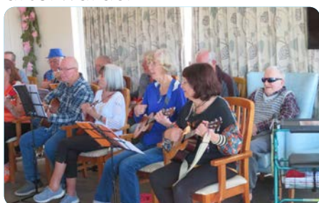
Spot the odd one out ... Eastern Ukles band