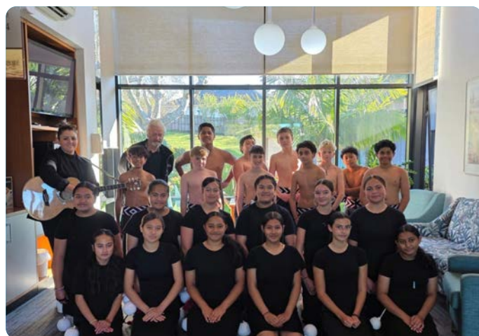
Howick Intermediate Kapa haka group