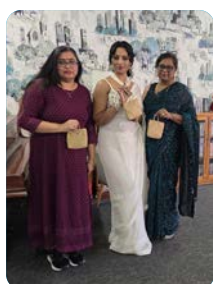
Shared Staff Lunch and Best Dressed Winners (Seymour Community)