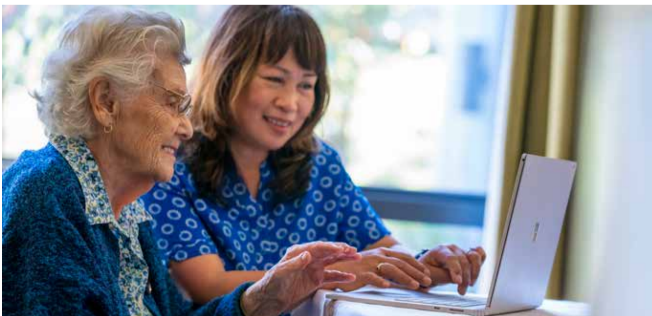
A CLOSE-KNIT COMMUNITY AND QUALITY OF CARE ARE IMPORTANT TO OUR RESIDENTS (SEE P2)