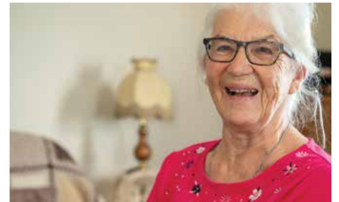
AS A NOT-FOR-PROFIT THE NEEDS OF OUR RESIDENTS COME FIRST.

HBH's not-for-profit status means we choose to offer more affordable options for seniors, enabling seniors who might not have sufficient income to live in other villages and care facilities to enjoy a better