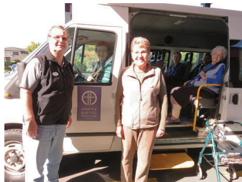
SOME OF OUR WONDERFUL VOLUNTEERS