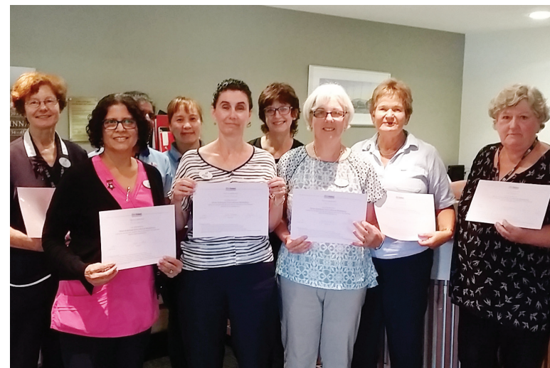
HBH STAFF AT THE END OF THE SILVER RAINBOW TRAINING

Based on 1 Corinthians 12:4 and Basis of Union, para. 13