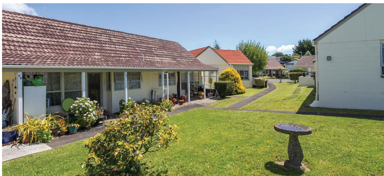
STEVENSON VILLAGE IN HOWICK WILL BECOME A PART OF HBH SENIOR LIVING IN JULY

As well as to a commitment to current and future tenants, HBH will be making additional support services available. The new services