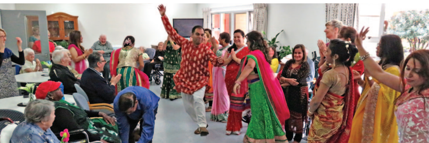
HBH RESIDENTS ENJOY A FASHION PARADE DURING DIWALI CELEBRATIONS

spontaneous events are exactly what our Eden programme is about, which makes this a great place to live and work and of course share the spirit of Christmas."