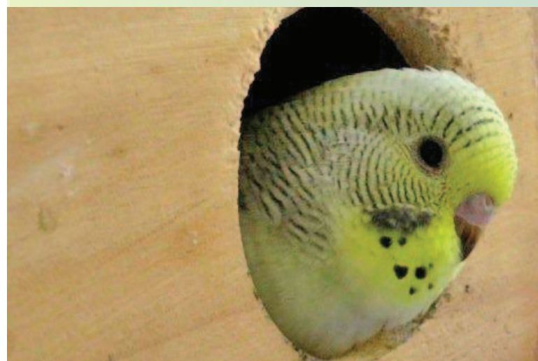
ONE OF OUR NEW BUDGIES POSES FOR THE CAMERA