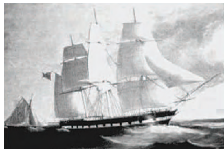
THE GEORGE SEYMOUR

and the team is very hands-on supporting staff, residents and their families. The Management Team liaises with groups and organisations outside HBH such as the District Health Board, the Ministry of Health and local community organisations. You'll see the team dashing about to various meetings and projects, but they also try to find time to get to know residents and families.