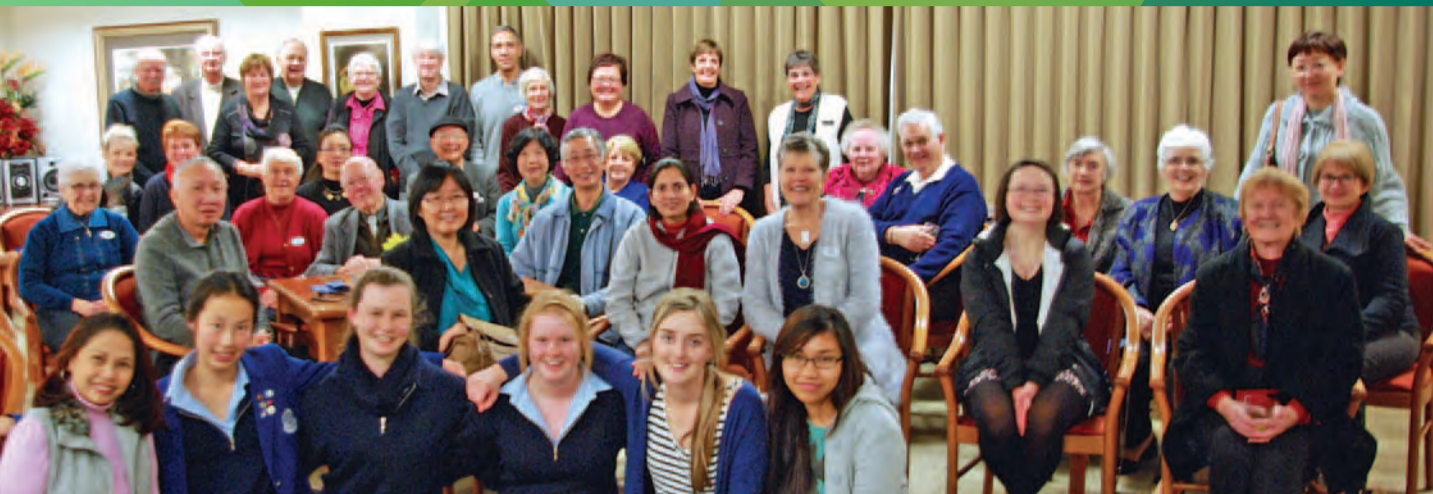
HBH VOLUNTEERS ENJOY A WINE AND CHEESE EVENING TO CELEBRATE NATIONAL VOLUNTEER WEEK

HBH SENIOR LIVING CARE & VILLAGE In every little way, we care