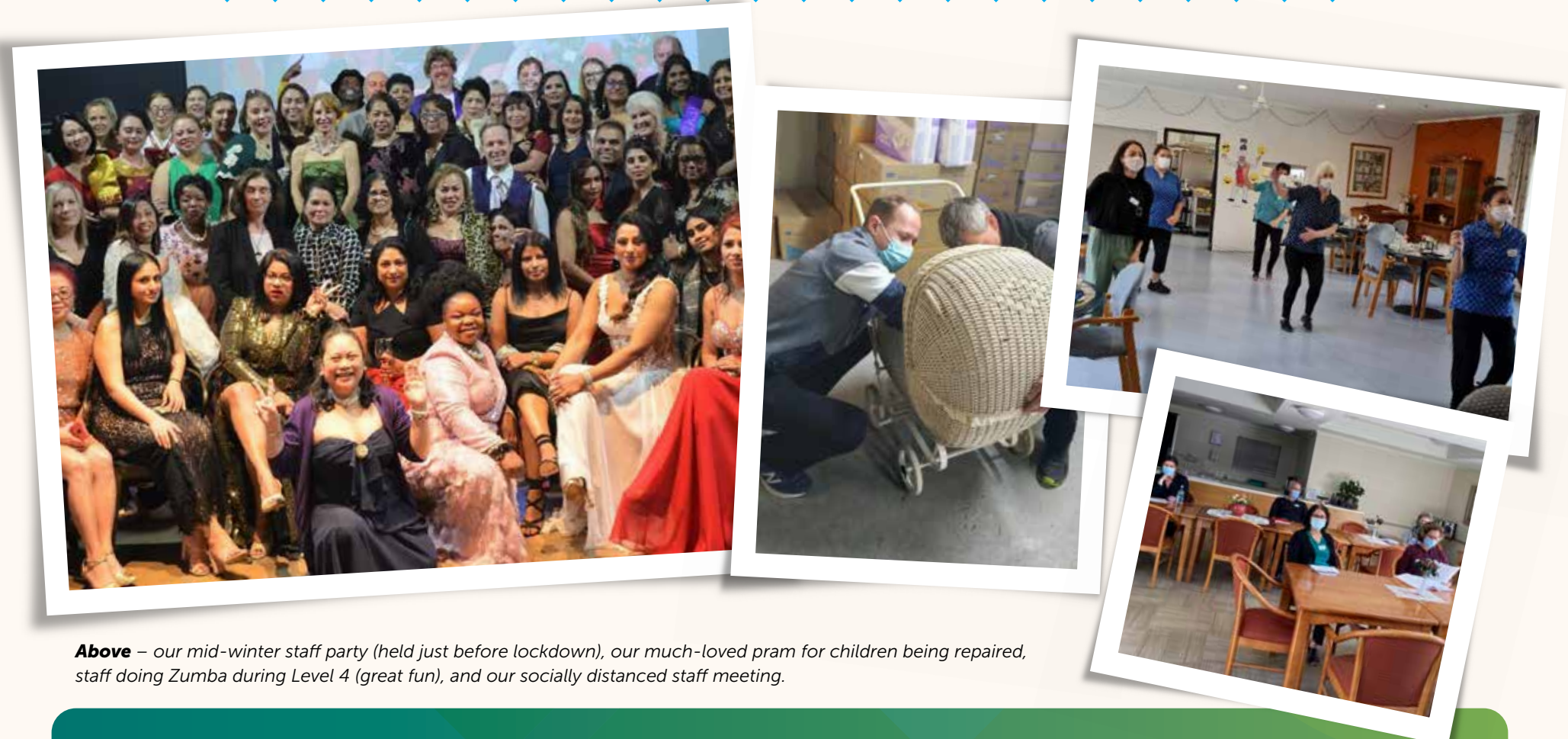
Above – our mid-winter staff party (held just before lockdown), our much-loved pram for children being repaired, staff doing Zumba during Level 4 (great fun), and our socially distanced staff meeting.