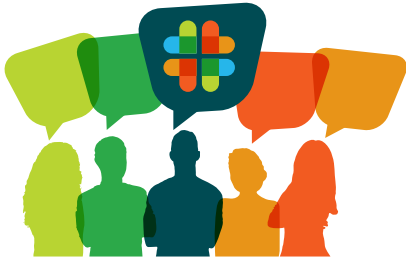
Friendly supportive staff