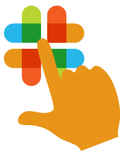
Call bell waiting times

Some of the things our residents and relatives thought we could improve upon.