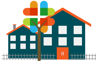
Comfortable, large rooms and bright, airy modern buildings