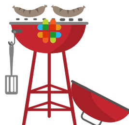
A sheltered outdoor area where families can have a picnic or barbeque