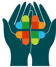
Individualised care that respects dignity and helps maintain independence