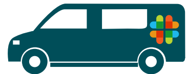
More activities at the weekend

We are working on getting more volunteers to assist.