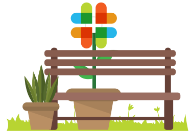
Well-kept gardens and courtyards